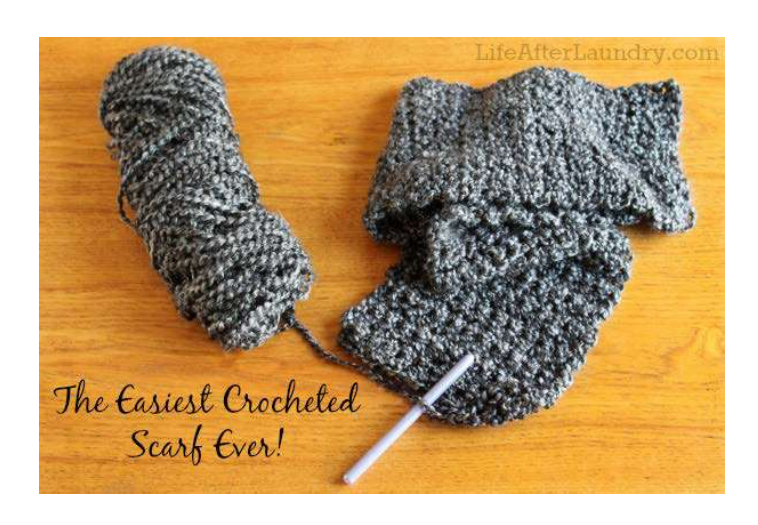
Sept. 20th at 10:00

Must sign up and pay for the class by end of day on Sept.20th